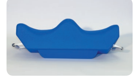
Model no. / Order no. 420.2040